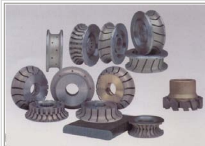
Diamond Work Grinding Wheel